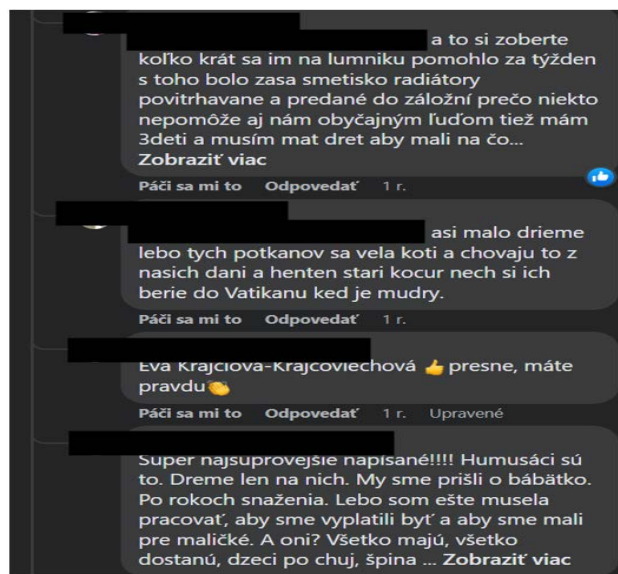
Fig. 2 part of the comments below the post regarding the visit of Pope Francis to Luník IX

[Transcription:]