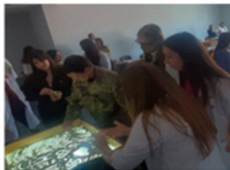
Fig. 1. Master class on sand therapy at the Interregional Academy of Personnel Management

filled with sand, with lighting from below (Fig. 1).