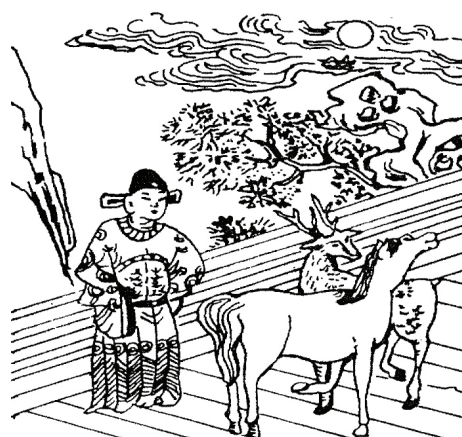
Fig. 2 Image for Hexagram No. 26 of I Ching Da Chu [6].

The previous state of integrity is the period when a person develops his best virtues and accumulates his merits. If they are implemented correctly, then so is a person can acquire enormous moral powers. They are, actually so to speak, and is the great one who can continue to educate. But such great moral strength is needed and the great object of their action. This object should be so wide, so that you can go beyond your personal boundaries. Therefore, the most important thing in this situation is to get out of your own way narrow sphere. In the previous situation, it was already achieved known synthesis of what is known and known again. But if a person would turn this synthesis only to his own benefit, then it would mean only overcoming one's faults. Here it is necessary to act in such a way that this action extends to other people, only then it can be called great. Of this reason can be said that it is not only meant here upbringing big, but also great upbringing. Therefore, in the text we see: «Education is great. Favorable stability. Hosulk not only from your home. Happiness. Favorable ford across a big river» [2]. The general meaning of the hexagram No. 26 Da Chu (possession of the great) in traditional Chinese medicine [2,4,6]: