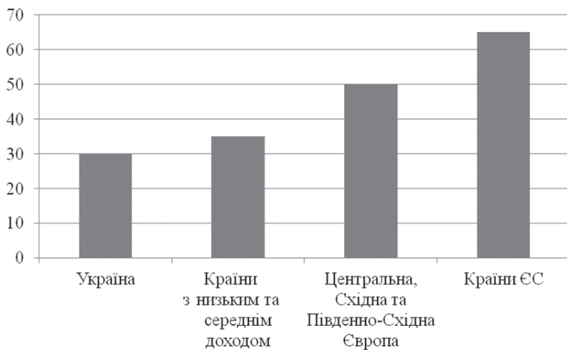
Fig. 1. The Corruption Perceptions of European Countries by the Corruption Perceptions Index, 2017 (*Developed on the basis of [11])

we have taken three European countries — Poland, Romania and Latvia, which started the transition to a market economy in 1992, today surpassed Ukraine by this indicator. Romania and Poland are two other big Eastern European countries with respectively 19,5 and 38 million inhabitants, compared with 43,9 million in Ukraine. Latvia is much smaller (2 million). In 1992 per capita GDP was approximately the same for these four coun-