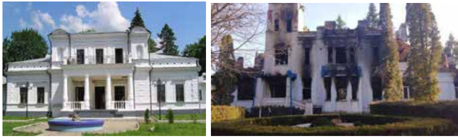
Fig. 7. NFT The estate of L.E. Koenig in Trostianets

during the war in the digital space. The proceeds from the sale of tokens are planned to be used for social projects to restore Ukraine's cultural heritage.