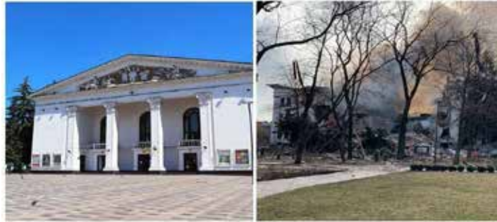
Fig. 4. NFT Donetsk Drama Theater