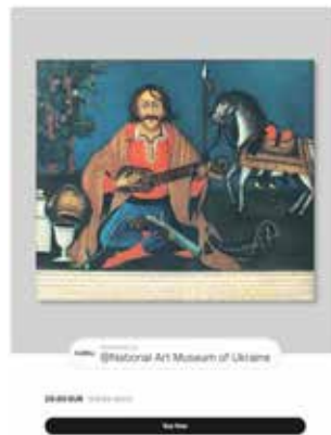
Fig. 2. Cossack Mamai as NFT at Patron-of-art NFT marketplace

Considering NFT as one of the tools for preserving and popularizing Ukrainian cultural heritage, we have developed a collection of NFT art aimed at preserving cultural and architectural monuments that were damaged or destroyed during the Russian-Ukrainian war. Similar projects have already been implemented and have shown their effectiveness. For example, the National Art Museum of Ukraine (NAMU), the oldest museum in Kyiv, created the NAMU NFT collections to support two goals: to raise funds for the NAMU and other museums in Ukraine that were affected by the war, and to promote Ukrainian culture around the world (Fig. 2). This project involved extensive consultation with Ukrainian cultural communities and included clear provisions to protect confidentiality and cultural sensitivity.