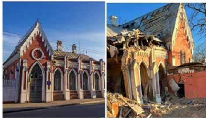
Fig. 5. NFT Regional Youth Library in Chernihiv