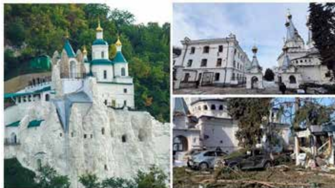
Fig. 3. NFT Sviatohirsk Lavra

The collection we have developed includes 5 architectural monuments that have been damaged and need to be restored. In particular, the Holy Dormition Sviatohirsk Lavra, the first mention of which dates back to the 15th century as a monastery complex that began to form in these places during the period of settlement of the "Wild Field" by the Cossacks and the creation of the first watch fortifications (Fig. 2).