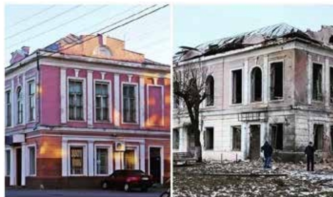
Fig. 6. NFT Local History Museum in Okhtyrka

Regional youth library in Chernihiv. The neo-Gothic building was built in the late nineteenth century. It housed the premises of an orphanage and the Vasyl Tarnovsky Museum of Antiquities, which kept items from the Cossack era and Taras Shevchenko's personal belongings. Since 1978, the library has been housed here.